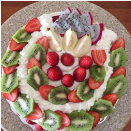
VANILLA FRUIT CAKE