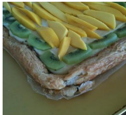
FRESH FRUIT CROSTATA with PASTRY CREAM